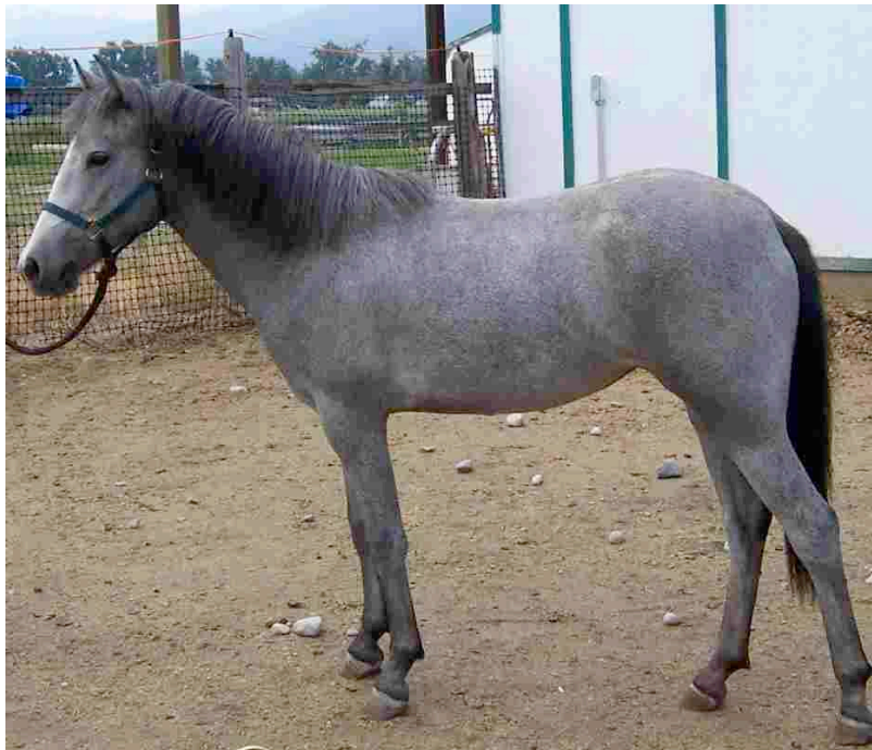
Cheval De Bois St. Beatrice