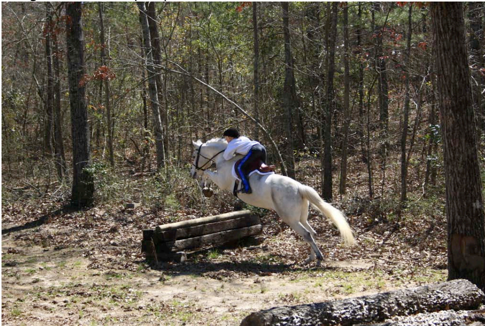
Manoravon Master Moonstone on cross country course