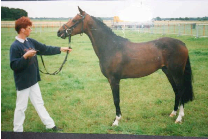
At Three Year Old Stallion Inspection

In May she started him under saddle, and, only four months later, in September, he placed 3rd in the New Forest show in his category (3- and 4-year-old ponies). In this competition, the pony earns points on 10 elements. The elements are subdivided into exterior, movement, and jumping. It was his first show.