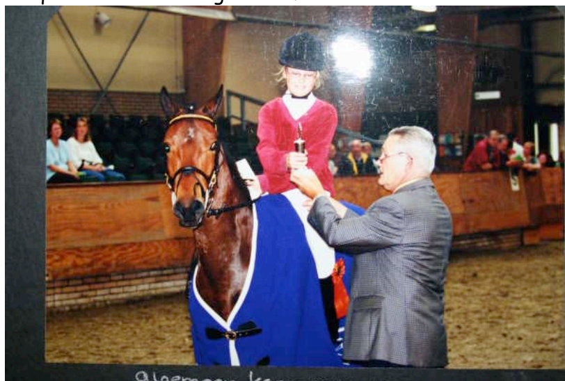
Champion New Forest of the Netherlands 2000

Enchanted Forest secured his most stunning victory in Holland that September. He entered and won the 3- and 4-year-old pony division of the New Forest Stud-book show; in addition, he won the Dutch Championship because, among all the competing ponies, he earned the most points. Seven out of 11 times he earned a 9 (out of 10) on his score form for, among other elements, step, gallop, exterior, aptitude as jumper, technique and work-willing-driven.