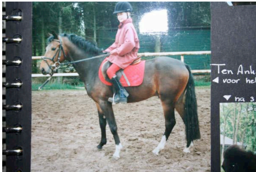
The First time under saddle