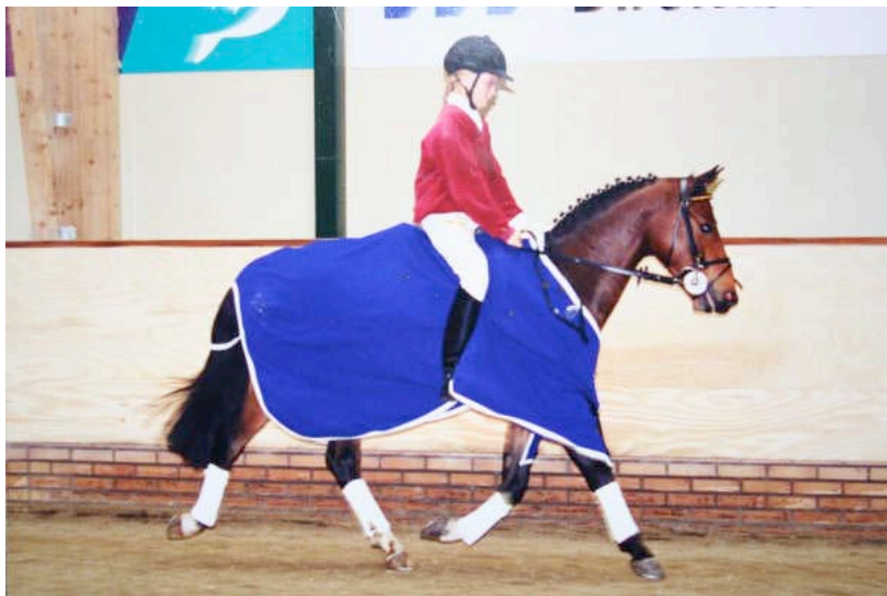
Champion of the Netherlands 2001